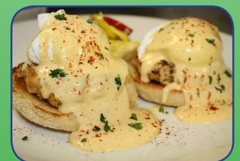
Crab Cake Benedict

Mixed gourmet greens, grilled chicken, fresh strawberries, walnuts, tomatoes with Blueberry Balsamic Vinaigrette.