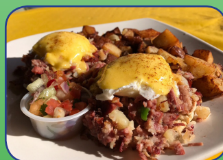
OMG Homemade Corned Beef Hash

Challah bread french toast stuffed with fresh bananas & blueberries sauteed in a sauce of butter, brown sugar, cinnamon & dark rum.