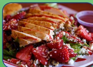
Grilled Chicken and Strawberry Salad

Slow roasted brisket, chopped with trio of peppers over potatoes. Grilled and served with 2 eggs. Your choice of toast and a side.