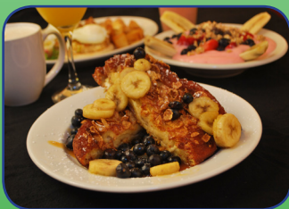
Banana & Blueberries Foster French Toast

Please present this flyer to your server.